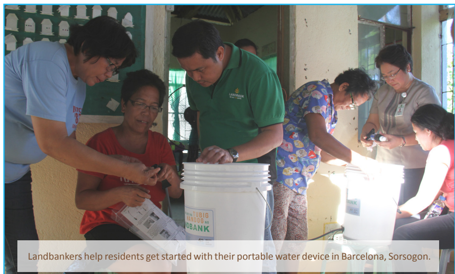
Landbankers help residents get started with their portable water device in Barcelona, Sorsogon.