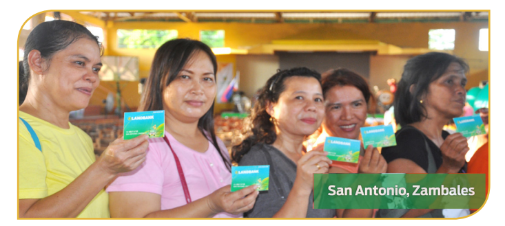
Photo shows some of the participants who were issued ATM cards as they availed of the special savings account being offered during the event. Bottom photos show turnout of residents in other caravan sites.

opportunities from representatives from DSWD and FINTQ, such as the "Panalo Sa Ipon at Kabuhayan Aahon ka Pinoy" (SIKAP) program. Panalo SIKAP is an incentivized credit and voluntary savings-linked program initially targeting 4Ps beneficiaries.