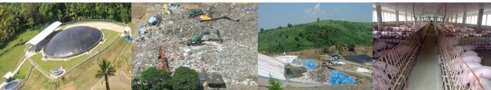
(L-R) Facilities of LANDBANK-assisted clients on board for climate change mitigation (from top): Biotech Farms; Asia Energysystems, Inc.; VGP Group, Inc.; and Marcela Farms.

1 carbon credit = 1 ton of methane or (CO 2 e)