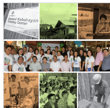
LANDBANK in 2013 Weaving the Strands Knowledge. Action. Transformation.

Showing true character, Cagayan de Oro is slowly rising and going beyond expectations through its people's own resilience and strength. LANDBANK along with Habitat for Humanity Philippines and other local units are finding ways to help CDO get back on its own two feet.