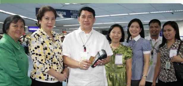
LANDBANK and MIAA officers and staff at NAIA Terminal 1.

Airline passengers will have a new option of convenience as LANDBANK recently partnered with valued client Manila International Airport Authority (MIAA) for the installation of Point-of-Sale units in the departure areas of all three NAIA International terminals as well as in the Manila Domestic Passenger terminal.