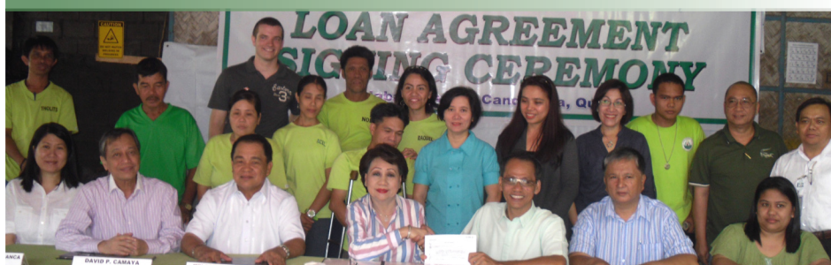
NFCPWD officers and staff pose with LANDBANK officials.

Established in 1998, NFCPWD is an organization of cooperatives which aims to create and provide opportunities for livelihood, employment, training as well as continuous development of PWDs to uplift their social and economic status. It currently has around 900 individual members who belong to 14 primary cooperatives from across the country.