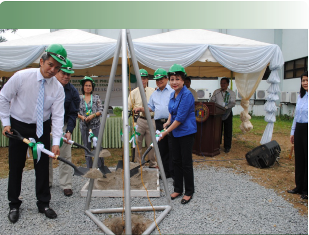
Trece Martires LGU representatives with LANDBANK officials at the groundbreaking ceremony.