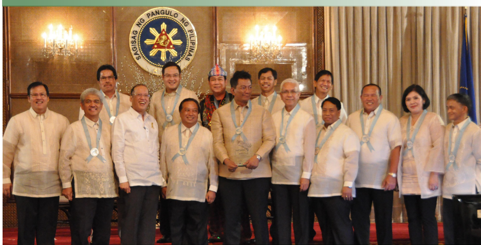
LGU awardees of the Galing Pook Foundation posing with President Aquino at Malacañan Palace.