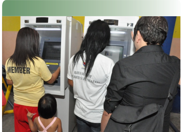
Beneficiaries of the 4Ps access their cash grants through LANDBANK mobile ATMs in Caloocan.

LANDBANK serves as the depository and disbursing bank of the Program. Aside from the LANDBANK Cash Card, cash grants can also be claimed through over-the-counter transactions in LANDBANK branches and other conduits such