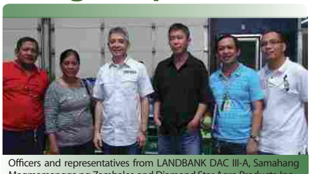
Magmamangga ng Zambales, and Diamond Star Agro Products, Inc

A potential boost in the industry is in the horizon as discussions on a possible agreement under the Food Supply Chain Program on mango production are ongoing among LANDBANK, the Samahang Magmamangga ng Zambales, and Diamond Star Agro Products, Inc.