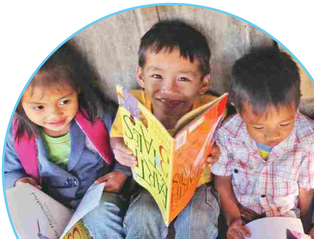
Above photos show some of the Landbankers who sat for caricatures during the LANDBANK Great Holiday Bazaar 2015. Some of the kids from the Cordillera Conservation (right) trying to figure out their new books.

Children's photos used are courtesy of CANVAS.