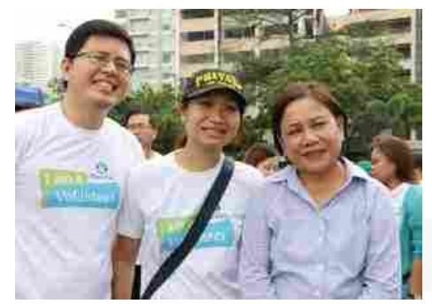
Senator Cynthia Villar poses with volunteers from new program partner Maynilad.

EarthVenture, Inc. was busy preparing materials for the Bokashi or EM mud balls making activity.