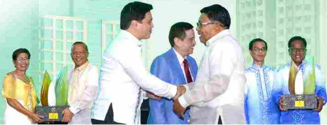
Hall of Fame Awardee Agri-based Category Buenavista Development Cooperative Buenavista, Guimaras

The Gawad sa Pinakatanging Kooperatiba or Gawad PITAK has been pioneering in the Bank's thrust to instill commitment, and commend the country's cooperatives who have worked tirelessly to pursue development in the countryside for more than two decades. The Gawad PITAK is now on its 27th year. Winners include two cooperatives inducted into the Hall of Fame and Ulirang Magsasaka awardee.