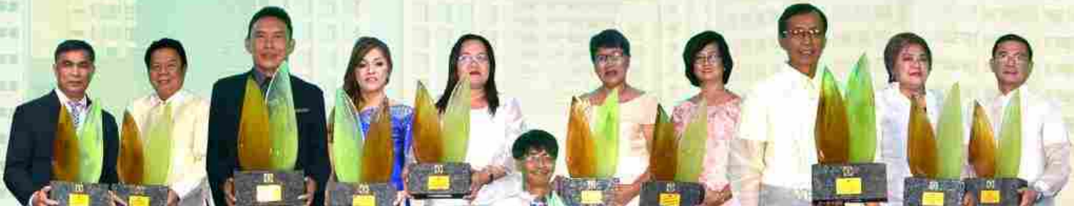
1st Runner-Up Libacao Development Cooperative Libacao, Aklan