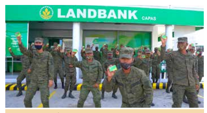
New PA recruits from Camp O'Donnell in Capas, Tarlac show their new LANDBANK Visa Debit Cards, the accounts for which were opened through the LANDBANK DOBS.

LANDBANK has received a commendation from the Philippine Army (PA) for its efficient online account opening platform through the Digital Onboarding System (DOBS) for making it easier to new clients such as Army recruits to open their payroll accounts.