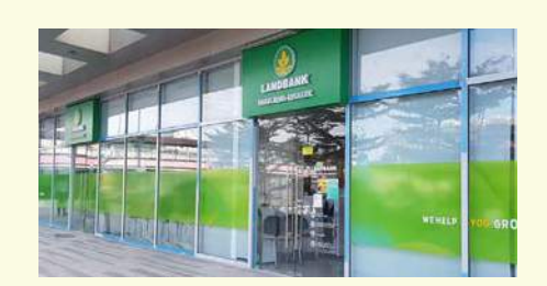
Roxas Boulevard - EDSA Extension Branch

Ground Floor, NAPOLCOM-NCR Tara Building, 371 Senator Gil Puyat Avenue, Makati City