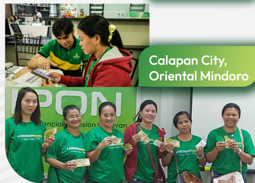
Calapan City, Oriental Mindoro