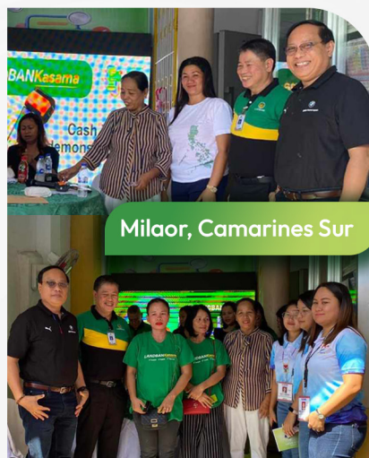
Milaor, Camarines Sur