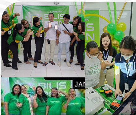
Cagayan de Oro City, Misamis Oriental