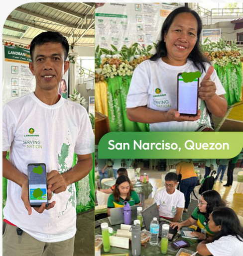
San Narciso, Quezon