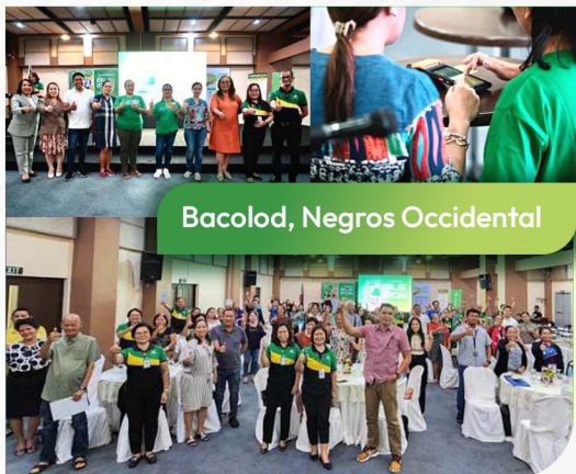
Bacolod, Negros Occidental