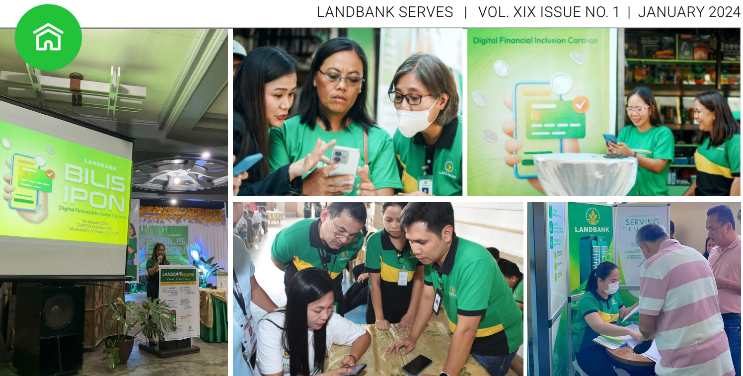
Landbankers assist clients in opening a PISO Plus Account during the Digital Financial Inclusion Caravan.

The Caravan also featured LANDBANK PISO Plus among the Bank's latest digital products, as well as promoted the habit of saving through the convenience of digital banking platforms such as the LANDBANK Mobile Banking App (MBA).