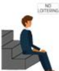
Loiter or idle around