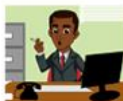
Smoke inside Bank premises