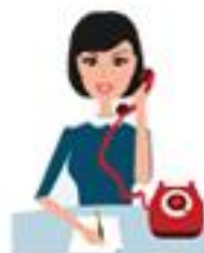
Follow telephone protocol