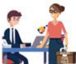
Peddle during office hours