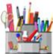
Use office supplies prudently