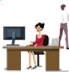
Leave the workplace without informing the supervisor