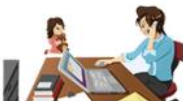
Bring children to office without proper authorization