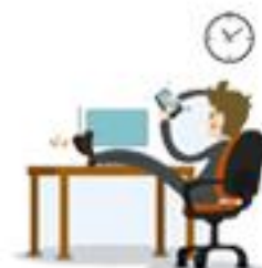
Play computer/mobile games