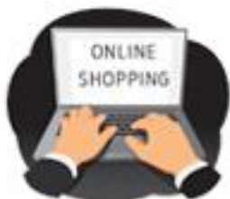
Attend to personal matters during office hours