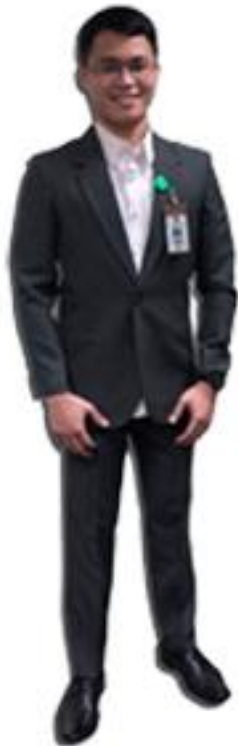
Wear proper office uniform and follow the dress code

It is important that employees conduct themselves properly according to the culture of the organization to be able to maintain good working relationship and protect the reputation of the Bank. As a Bank, we observe good work practices and office etiquette.