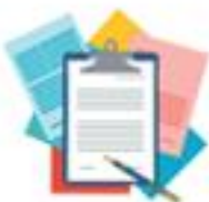
Observe proper handling of official documents and communications