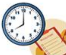
Strictly observe office hours and attendance, rules and regulations