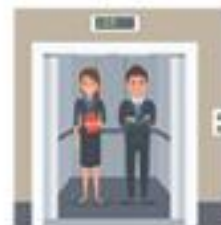
Observe elevator etiquette