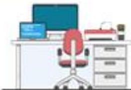
Protect and properly use Bank properties and facilities