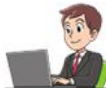
Adhere to policies on the use of email and internet facilities