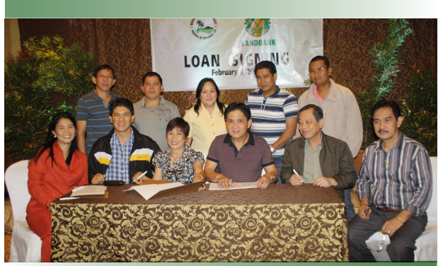
Officials and representatives from both LANDBANK and the Tinambac LGU at the February 8 signing.