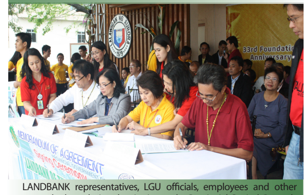
guests look on during the signing at the Provincial Capitol Grounds last February 13.

More than 1,000 officers as well as employees of the Provincial Government of Aurora will soon enjoy the greater convenience of receiving their salaries through LANDBANK e-Cards.