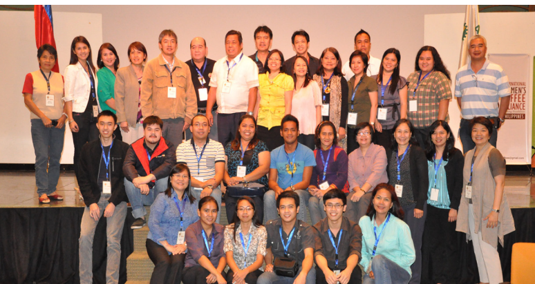
Some of the participants of the 6th National Coffee Summit held at the LANDBANK Plaza

educating and encouraging more folks toward coffee farming for self-reliance and peace. Along with PCBI, she is appreciative of LANDBANK's presence in the region as financial opportunities there are limited, as well as the Bank's support for the coffee industry in the country.