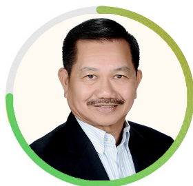
Emmanuel F. Piñol

Ex-Officio Chairman Secretary, Department of Finance