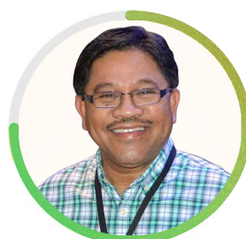
Rafael V. Mariano

Ex-Officio Member Secretary, Department of Agriculture