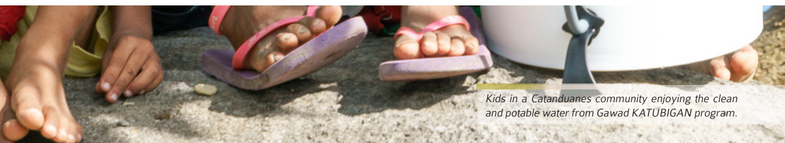
Kids in a Catanduanes community enjoying the clean and potable water from Gawad KATUBIGAN program.