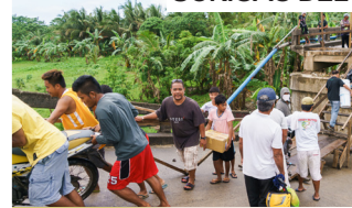
Preparing and Responding: La