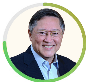
Carlos G. Dominguez III

Ex-Officio Chairman Secretary, Department of Finance